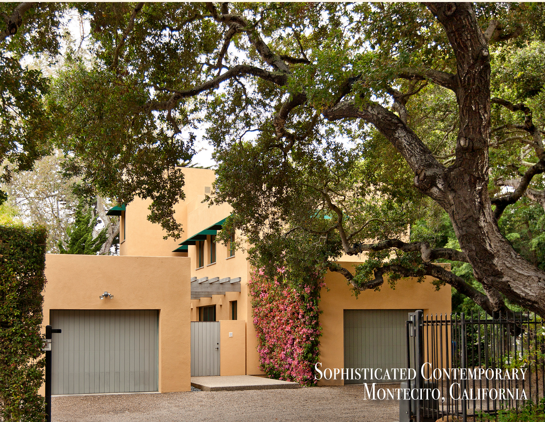
SOPHISTICATED CONTEMPORARY MONTECITO, CALIFORNIA